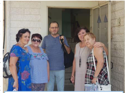
Women's Shelter team

Work with abused women is a new ministry area for us in which we lack knowledge and experience, and the Lord wonderfully supplied this need, when an Israeli lady who worked in this sphere for 30 years called us (after reading about our new Shelter on a Messianic website) and suggested us a free course (through Zoom) about helping victims of domestic violence! This course