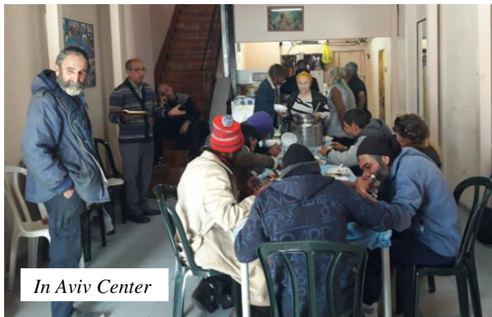
In Aviv Center