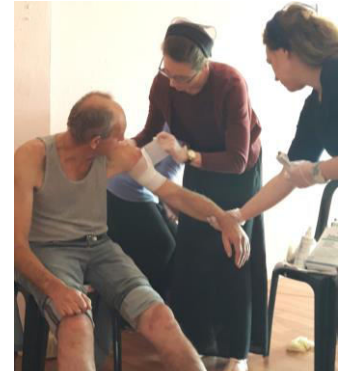
First medical aid in Aviv Center