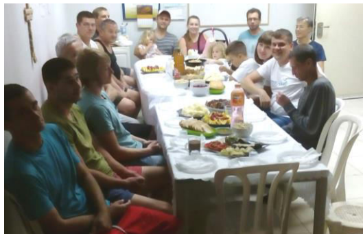
Rehabilitants and Bible teachers at a meal

We are grateful to the Lord for two more men who have completed our rehabilitation program and have started living independently. It means that recently the total of five rehabilitans have become our “graduates”. We continue to keep in touch with them. Please pray for them too.