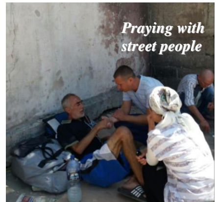
Praying with street people