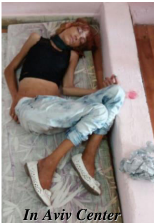
In Aviv Center