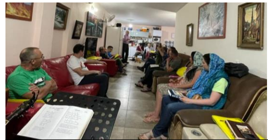
Immigrants at a Bible study in the rehab