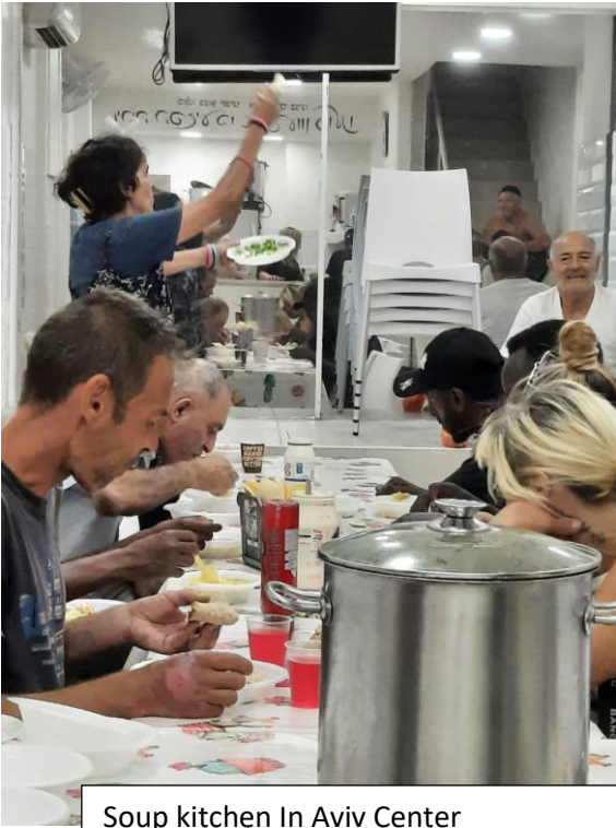
Soup kitchen In Aviv Center