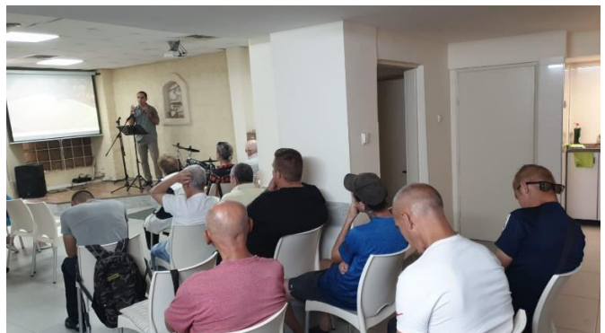
Rehabilitants at our church service