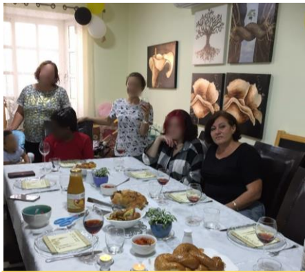
Shabbat celebration in the Shelter

After the meeting the social workers also asked us more questions about our Shelter and its Christian program - and said they may be sending us more ladies in the future! We are grateful that this way we could share about our faith with Israeli authorities.